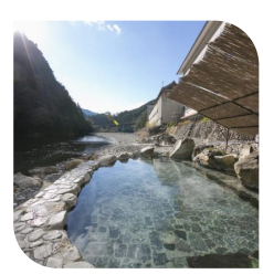
Yunomine Onsen, Japan

A UNESCO-listed onsen resort on the Kumano Kodo pilgrimage route